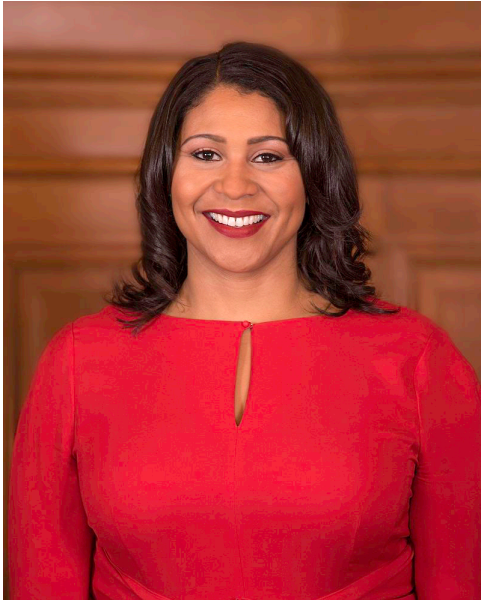
Mayor London N. Breed

Mayor London N. Breed and Climate Mayors from across America condemned the Trump Administration's new proposal to weaken vehicle efficiency standards and rescind California's waiver right to set strong greenhouse gas regulations. The proposal would hinder U.S. efforts to curb auto emissions and the resulting air pollution.